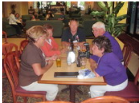
Members enjoy visiting at one of the happy hours

Send your email and name to WebMaster@VioletteFamily.org