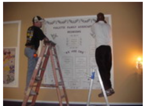
This large display showed all the Reunions to date and gave the names of the officers at the time of each Reunion as well as the Reunion Committees