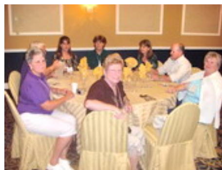
One of the tables at Friday night's dinner